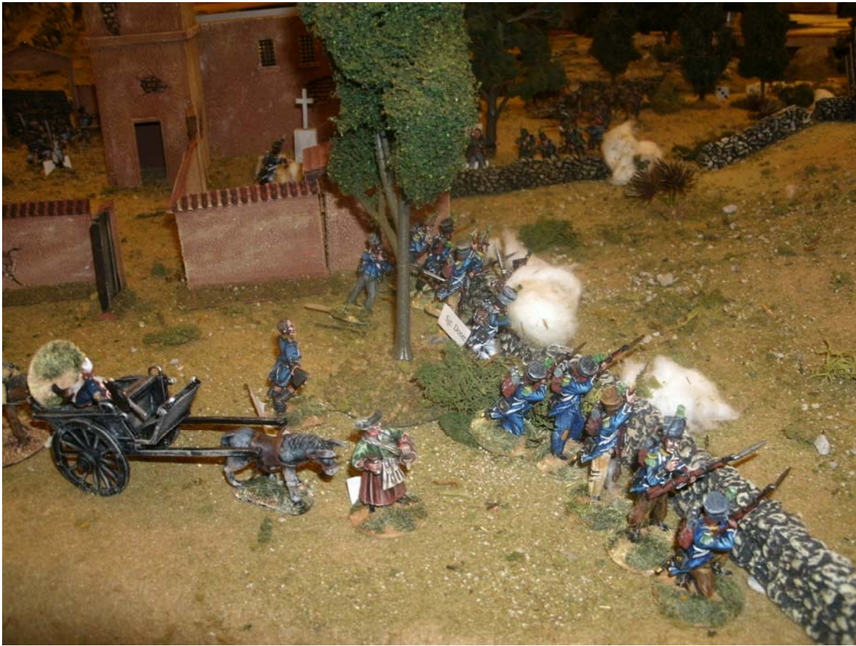
Chris Hughes 40mm Napoleonics. No French force could function without the cantiniere.