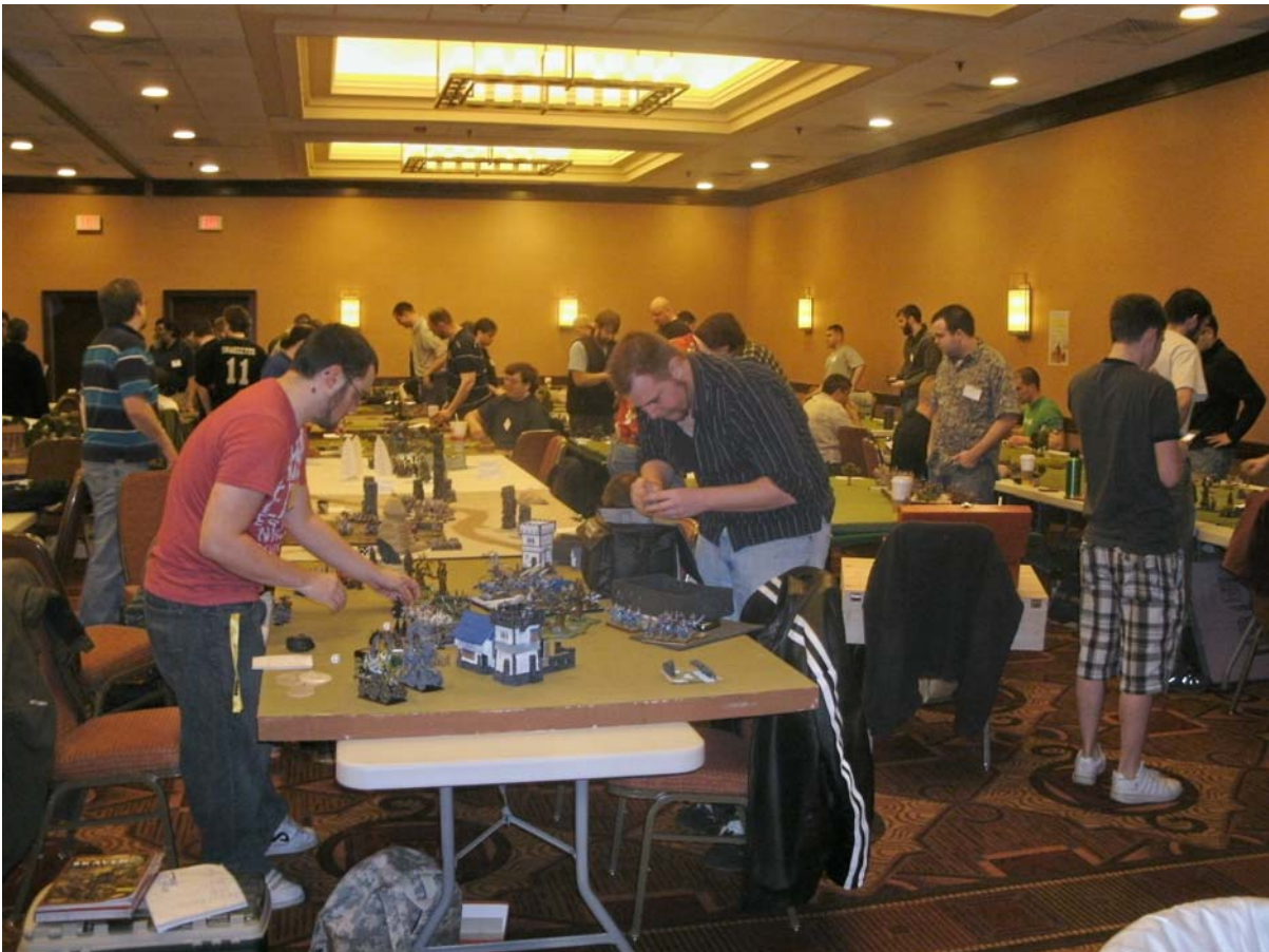
The Dark Side of the Force Was Well Represented by a WARHAMMER Tournament