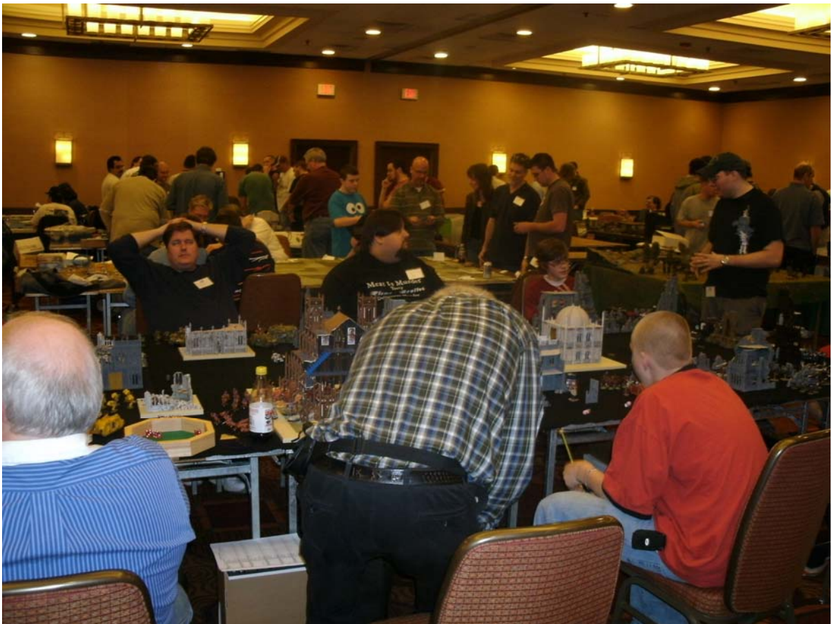
Wall to Wall Gaming on Saturday