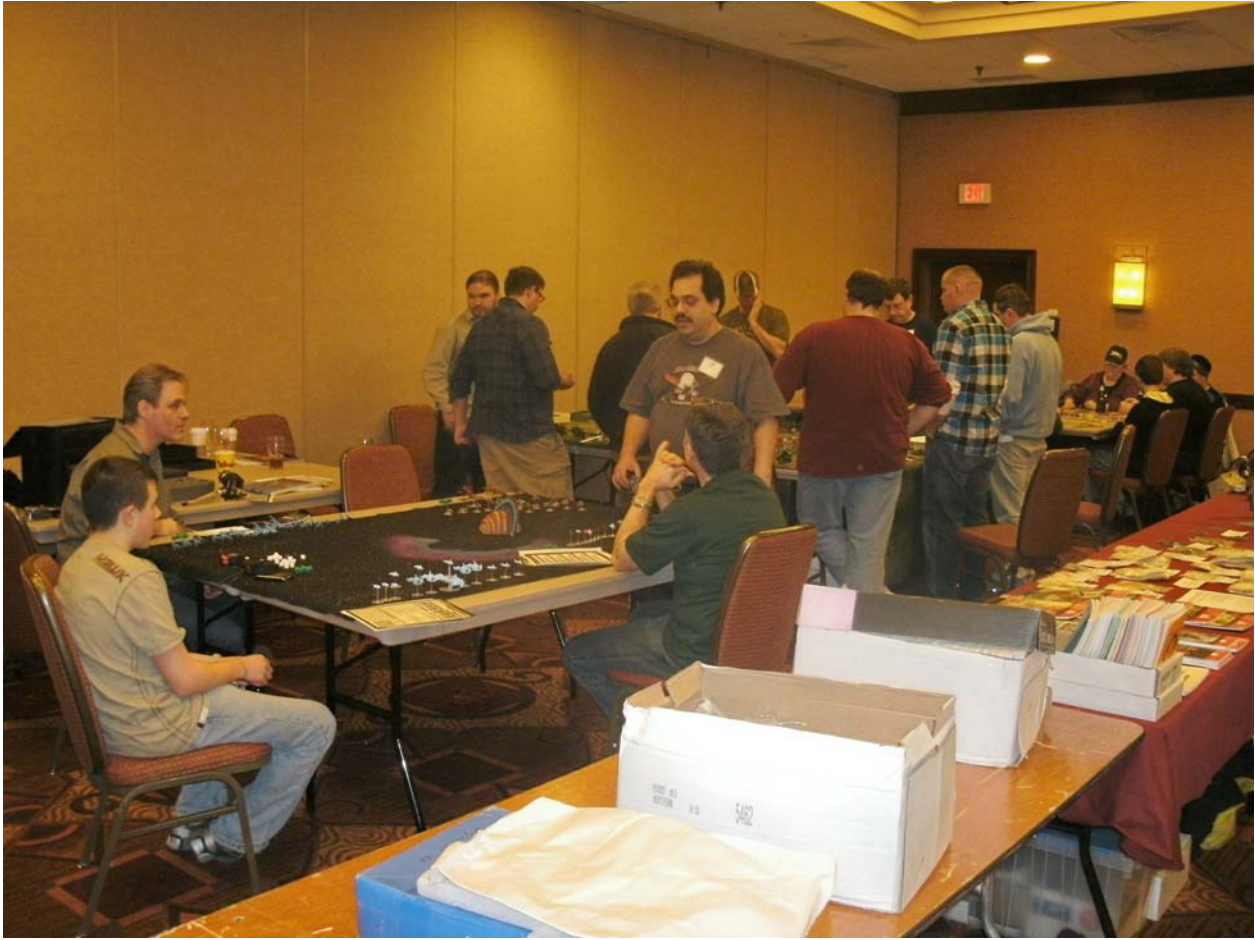
Getting started slowly on Friday Morning

Spring Fever is a relatively recent production from Triangle Simulation Society, the war game club which brought us SOUTHERN FRONT and HMGS, more or less in that order. It has followed SOUTHERN FRONT to the North Raleigh Hilton. A nice venue, but also one which does not seem affected by the recession. And TSS needs the biggest of the “meeting rooms” at the hotel.