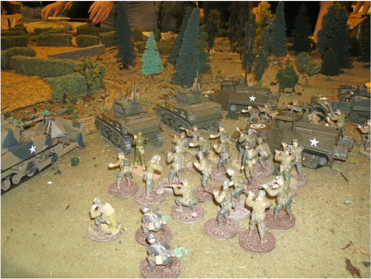
WWII In 54mm-I think the Germans won